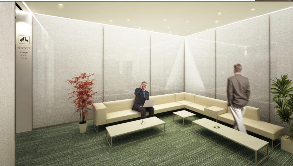
Lounge space provided