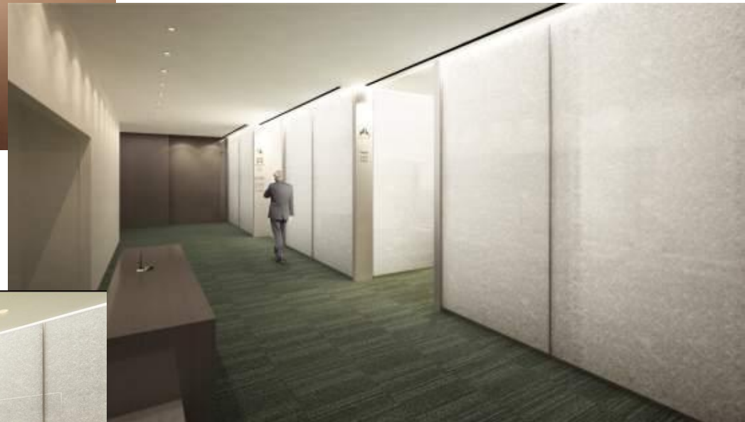
Complete with CIQ facilities for swift passport control