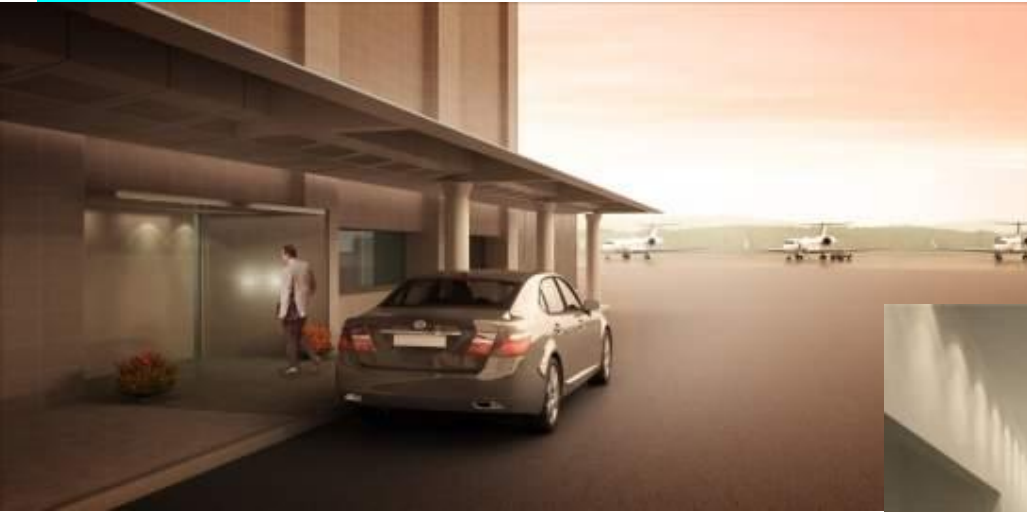
Boarding and deplaning near the terminal