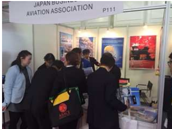
JBAA Booth at Shanghai, ABACE2015

We, JBAA, had our own booth at Shanghai, ABACE2015 and plan to have the booth at NBAA2015 to introduce BJ status in Japan.