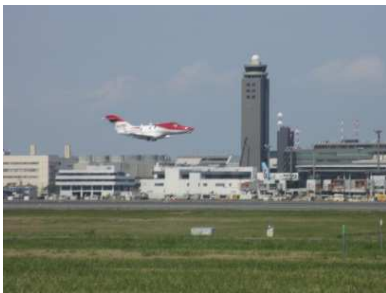
HondaJet Takeoff at Narita International Airport

After Japan, the HondaJet will travel to Europe for EBACE2015